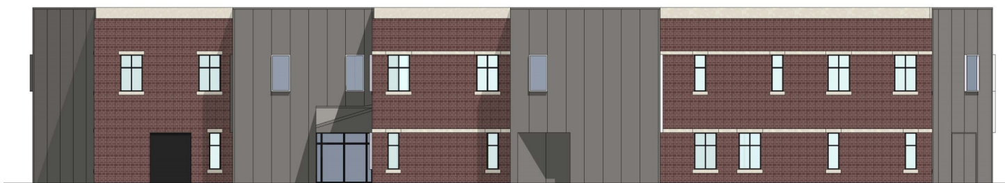
View from Hickory Lane

The interior demolition is well underway, and temporary interior walls are in place in the public hallways. Excavation and foundation work is scheduled to start soon. Removal of the precast panels is expected to start in late August.