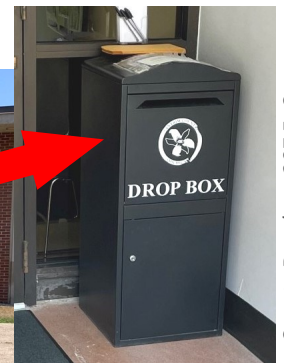
County Dropbox: 207 E. Cayuga